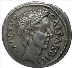
Cesar's coin Public Domain